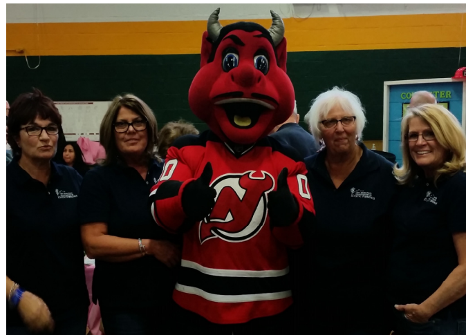
The NJ Devils supported the Totowa Health Fair