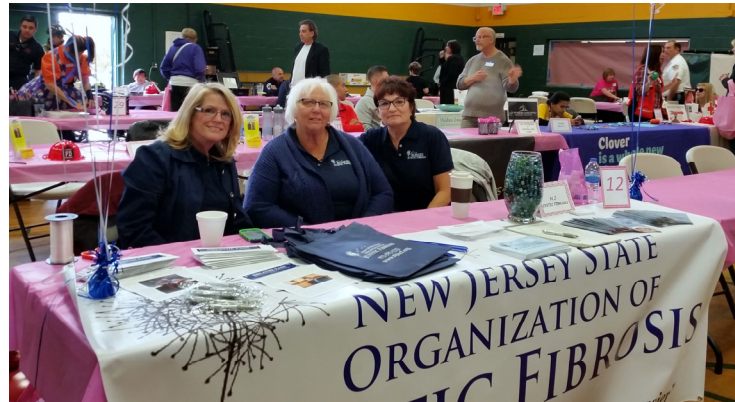
The NJSOCF team was on hand all day

NJSOCF staff and volunteers hit the road over the past months to raise awareness about cystic fibrosis and the services available through our organization.